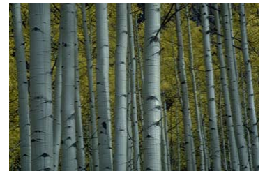
Stop by the township office to see the new Greenway Plan for Highland Township.

On May 23, 2007 we will host a special Global Warming Seminar at 7:00 p.m. at the Highland Senior Center . Join us for this exciting and highly informative event!