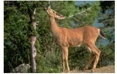
Woodlands and connected green spaces are important for all wildlife.

rare plants that haven't been seen in years in other places. So what can we do? Communities including Highland in Oakland County are creating a Greenway blueprint to link up these natural areas into a connected network. Even those who live on small parcels or lake lots can be involved in preserving wildlife habitat simply by planting native Michigan trees, plants and hedgerows, or use non-phosphorous fertilizers. Log onto www.oakgov.com/es for more info on open space and greenway planning.